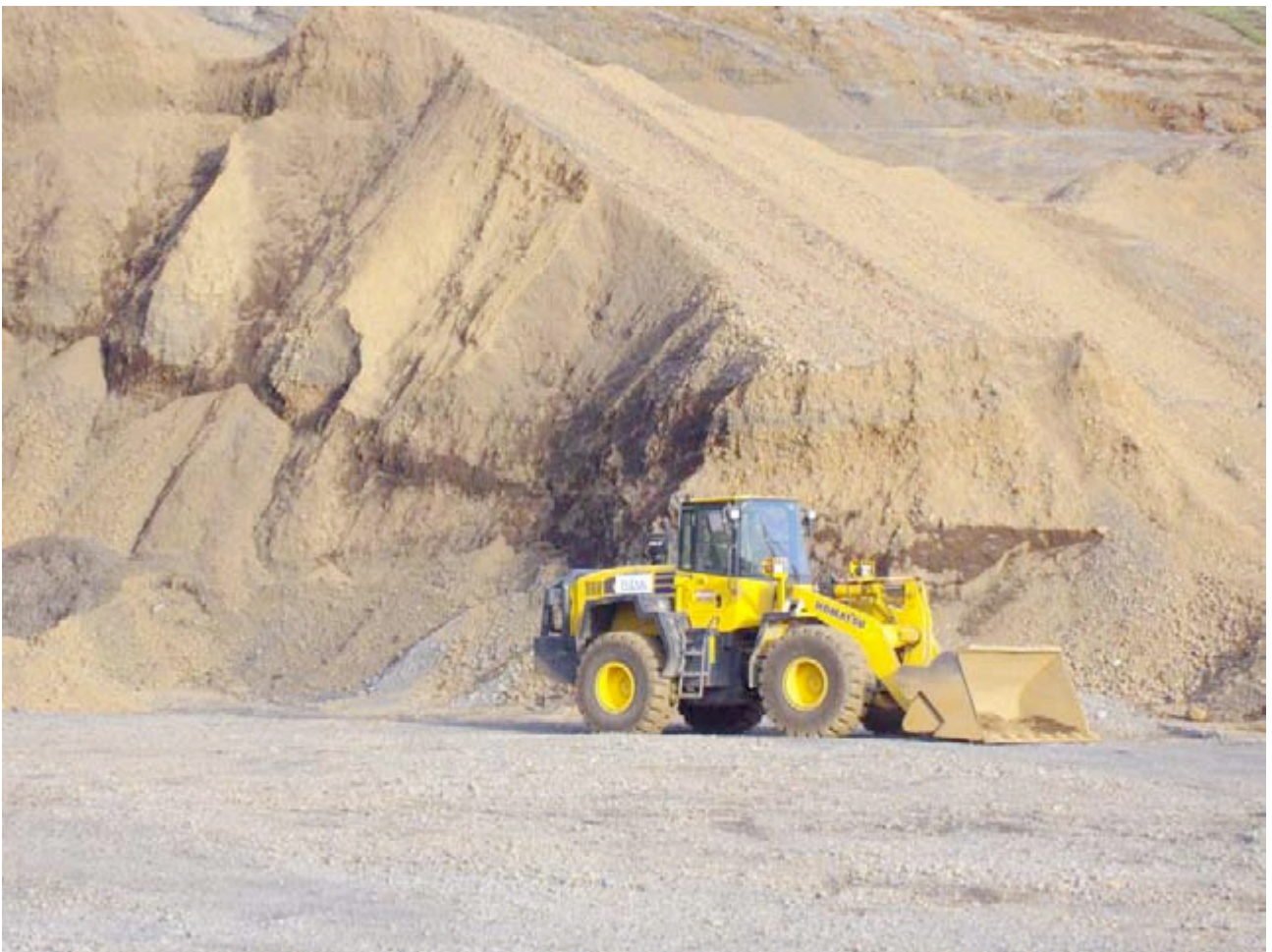
Digging away the side of a mountain