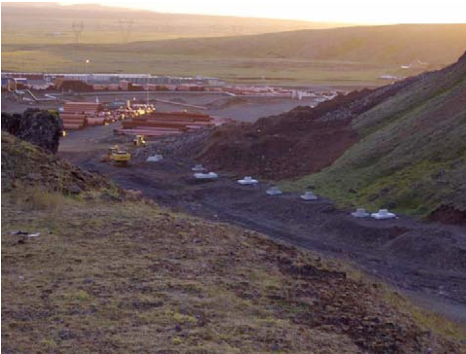
Laying of new pipelines.