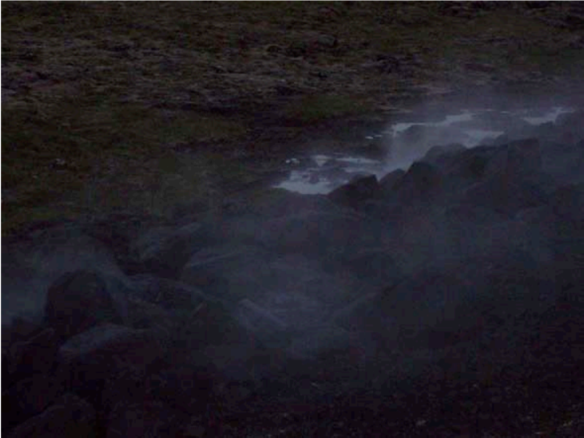
Leaks with steamy effluent running off