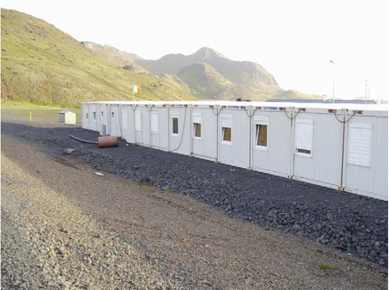
The work camp where the Romanian and Polish workers live.