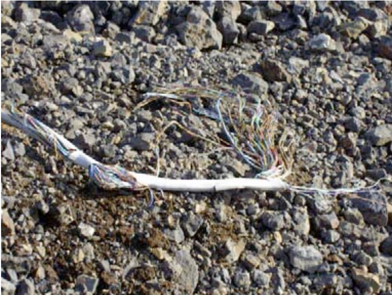
Remains of explosives